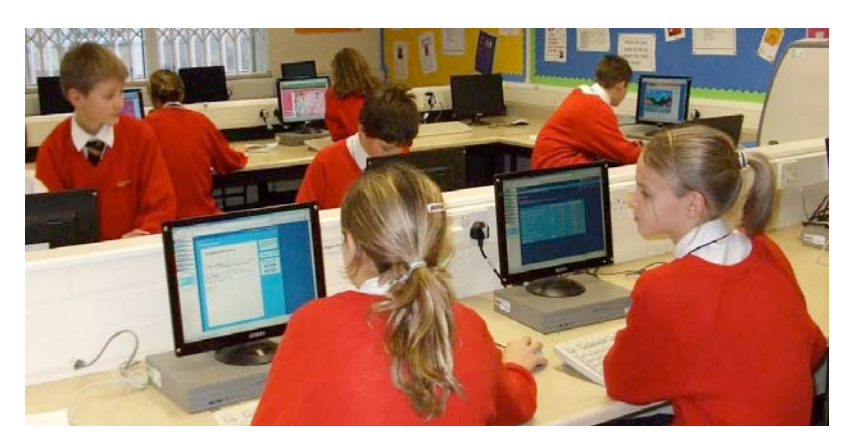
Pupils receiving specialist IT training at Woodland Middle School which has "a relentless focus on teaching and learning"